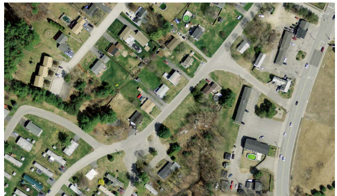
6-inch image at 1:1200 scale