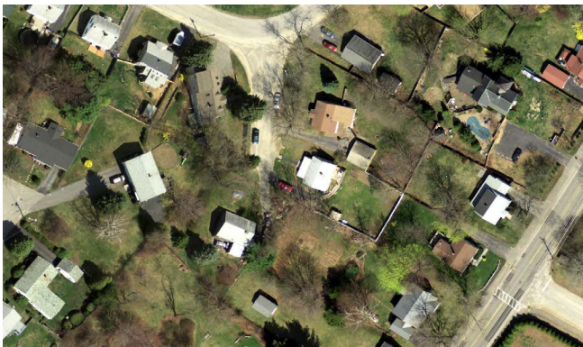
3-inch image at 1:600 scale